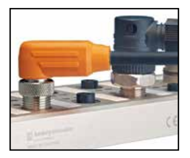
Low-profile space-saving design