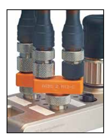
2 signals per port

Worldwide compliance with national and international standards provide for global integration.