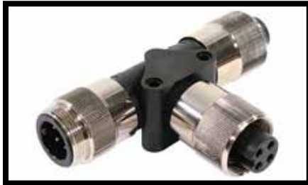
D-Size 1 3/8" Mini Power 3- and 4-Pole, Drop Tee, Male-Female-Female