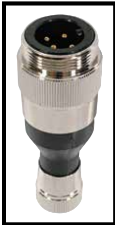
D-Size 1 3/8" Mini Power to A-Size 7/8" Mini Reducer, 3- and 4-Pole