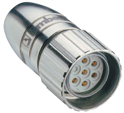
0906 UFC 201